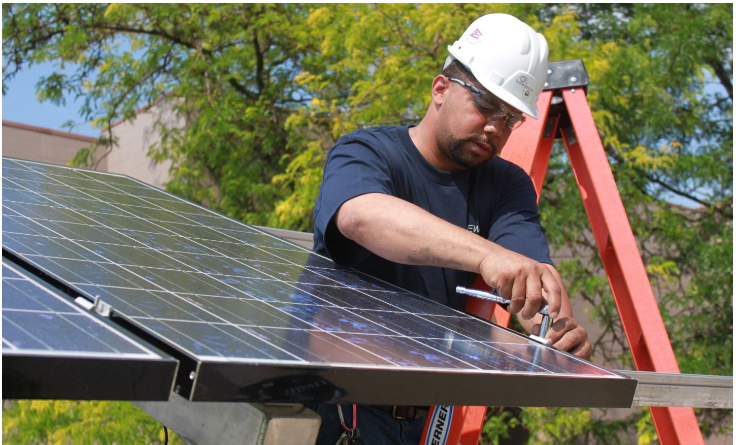
IBEW Local 683 worker installing solar panels.