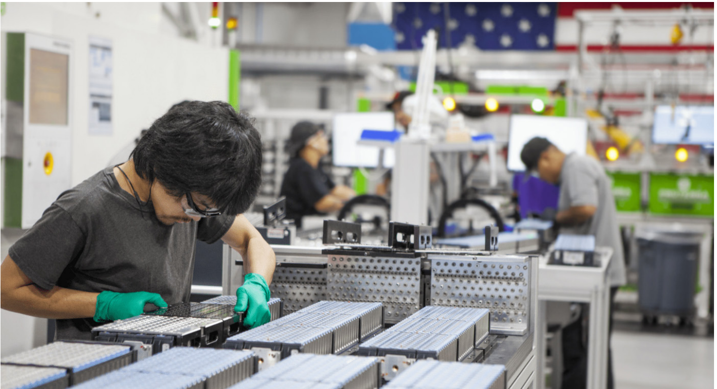
Union employees working in a Proterra manufacturing plant.

Thanks to advances in technology and environmental policy, a large-scale changeover to zero-emission vehicles (ZEV) such as electric buses is becoming a more achievable goal. For example, orders for electric school buses are expanding as school districts across the country recognize the health benefits for drivers and students in addition to the yearly projected $2,000 savings per bus in fuel costs and $4,400 savings per bus on maintenance. 55 Industry analysis predicts that the U.S. market for ZEV buses is likely to expand dramatically in coming years, reaching an annual growth rate of up to 24 percent by 2025. 56 Switching to electric buses represents a huge opportunity to cut pollution and improve the health of bus drivers, riders, students, and communities and an opportunity to create thousands of high-quality jobs building new buses.