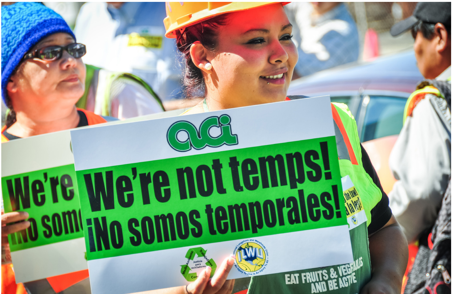
Striking ILWU recycling workers at the Davis Street Resource Recovery Complex and Transfer Station in San Leandro, California, in October 2014.